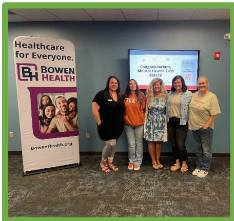
Mental Health First Aid Training in partnership with the Bowen Center.

Financial health, resident health, staff health. God provides it all.