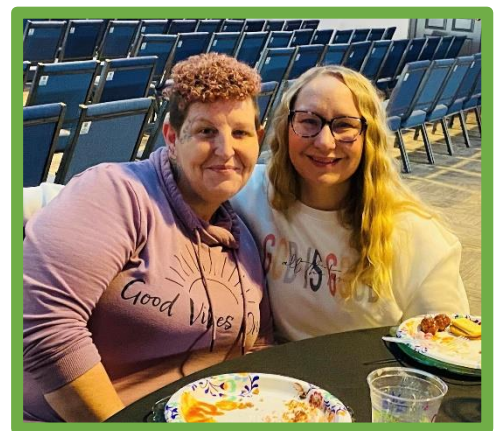
The Mentor Program is making a HUGE difference!