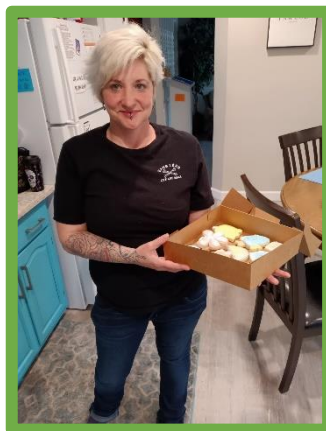
A volunteer shared her passion for cookie decorating!